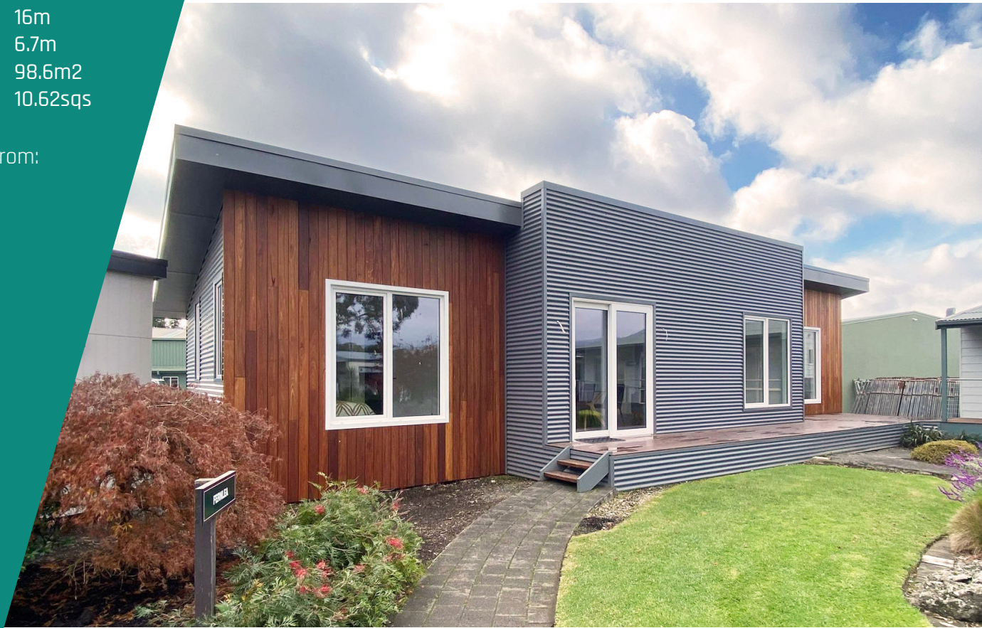
VILLAGE DISPLAY MODEL