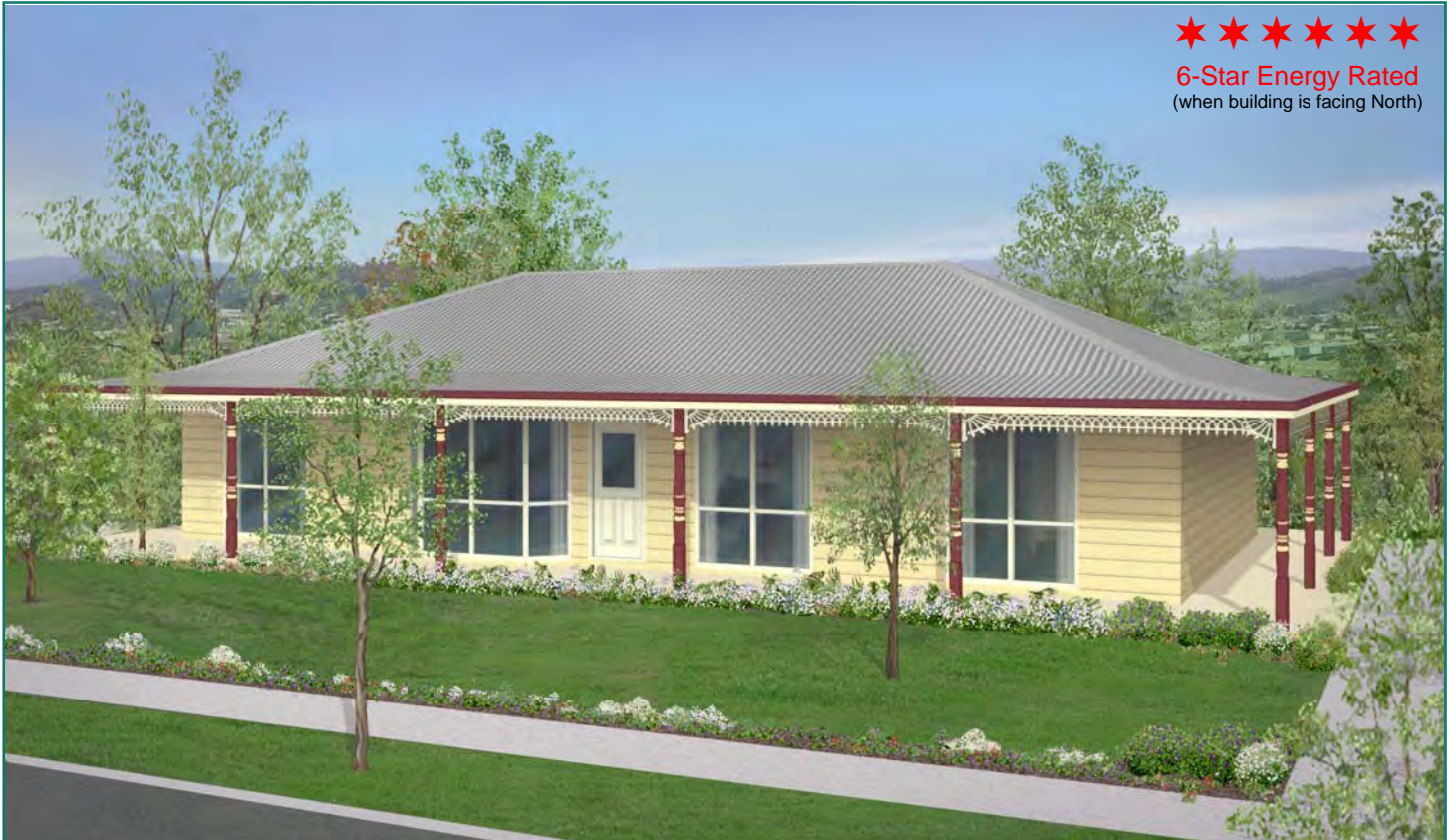
◆ Australian Homestead Façade pictured

★★★★★★ 6-Star Energy Rated (when building is facing North)