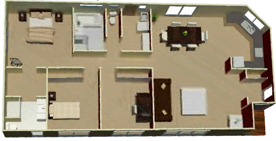
The Bramley II - A home for all occasions

Open plan living at its best is to be found in The Bramley II. The layout of the living areas is designed to suit many lifestyles. The Kitchen is open to the Dining area, which is ideal for family dining. If entertaining, the Dining area can be opened to the outside, allowing guests to flow out onto the adjoining alfresco area.