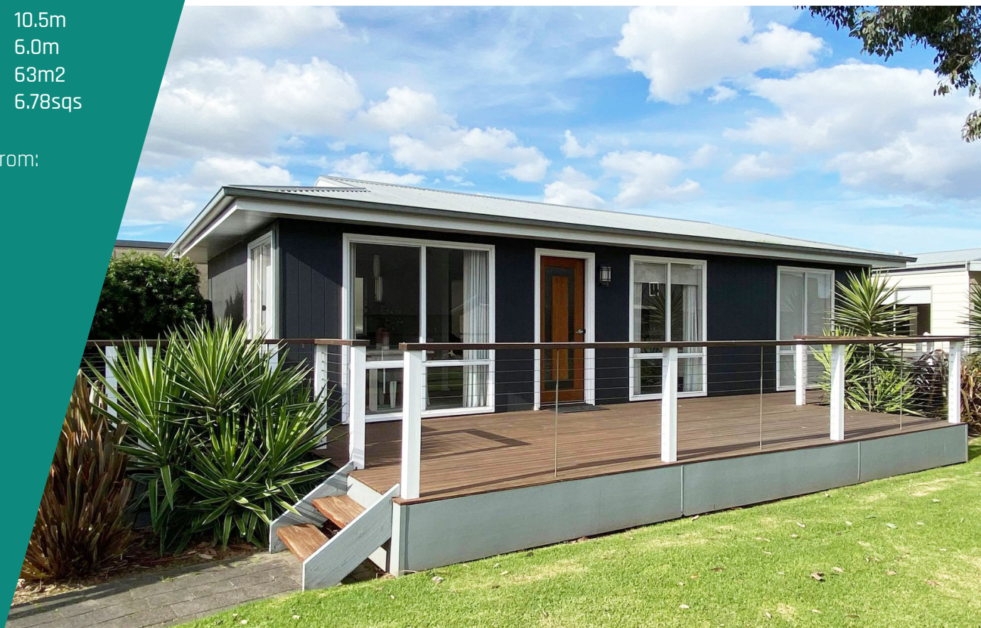
VILLAGE DISPLAY MODEL