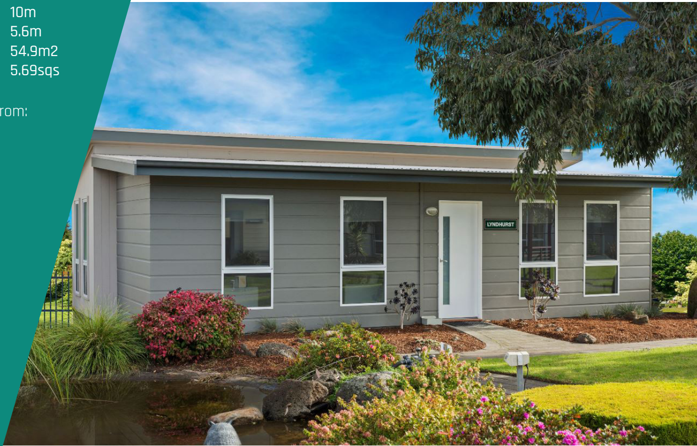
VILLAGE DISPLAY MODEL