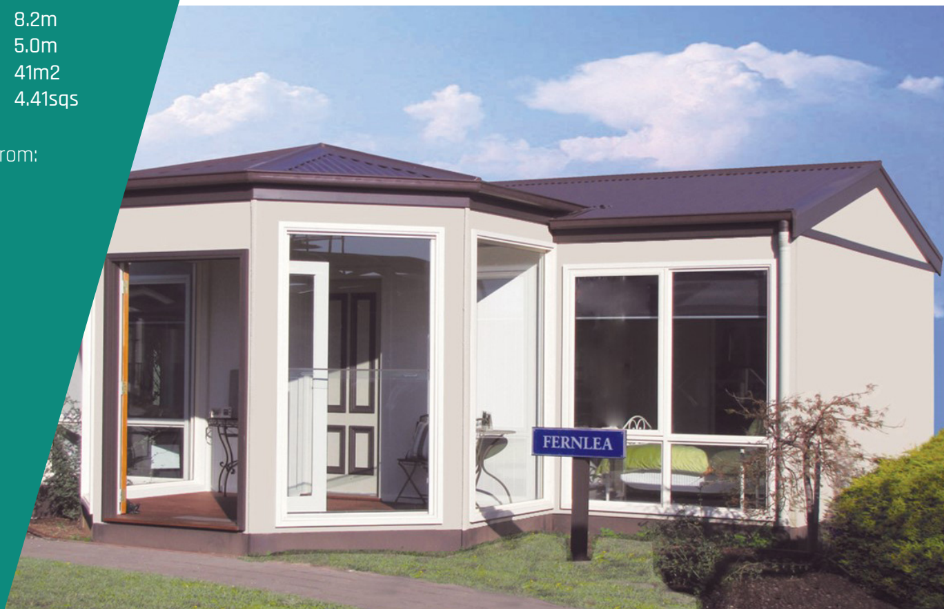
VILLAGE DISPLAY MODEL