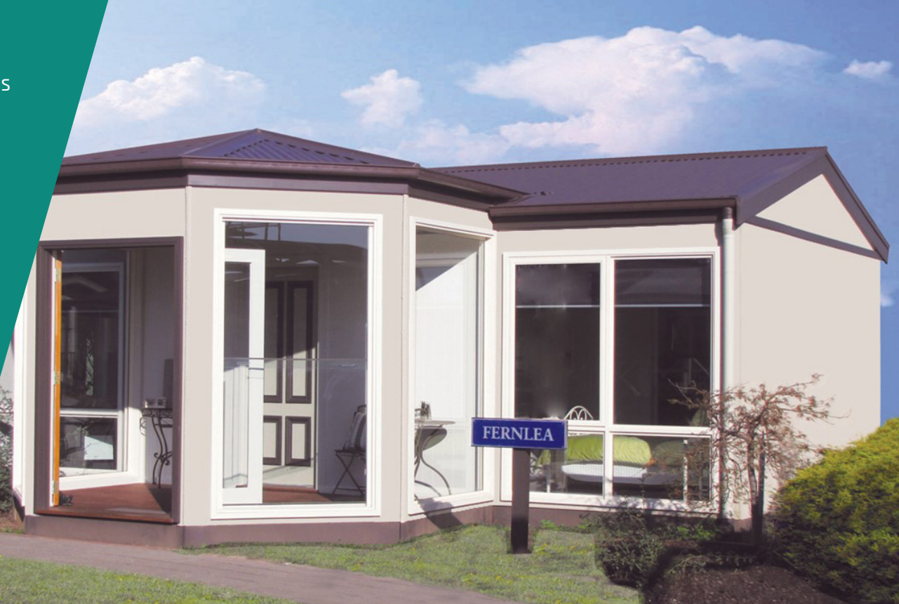
VILLAGE DISPLAY MODEL