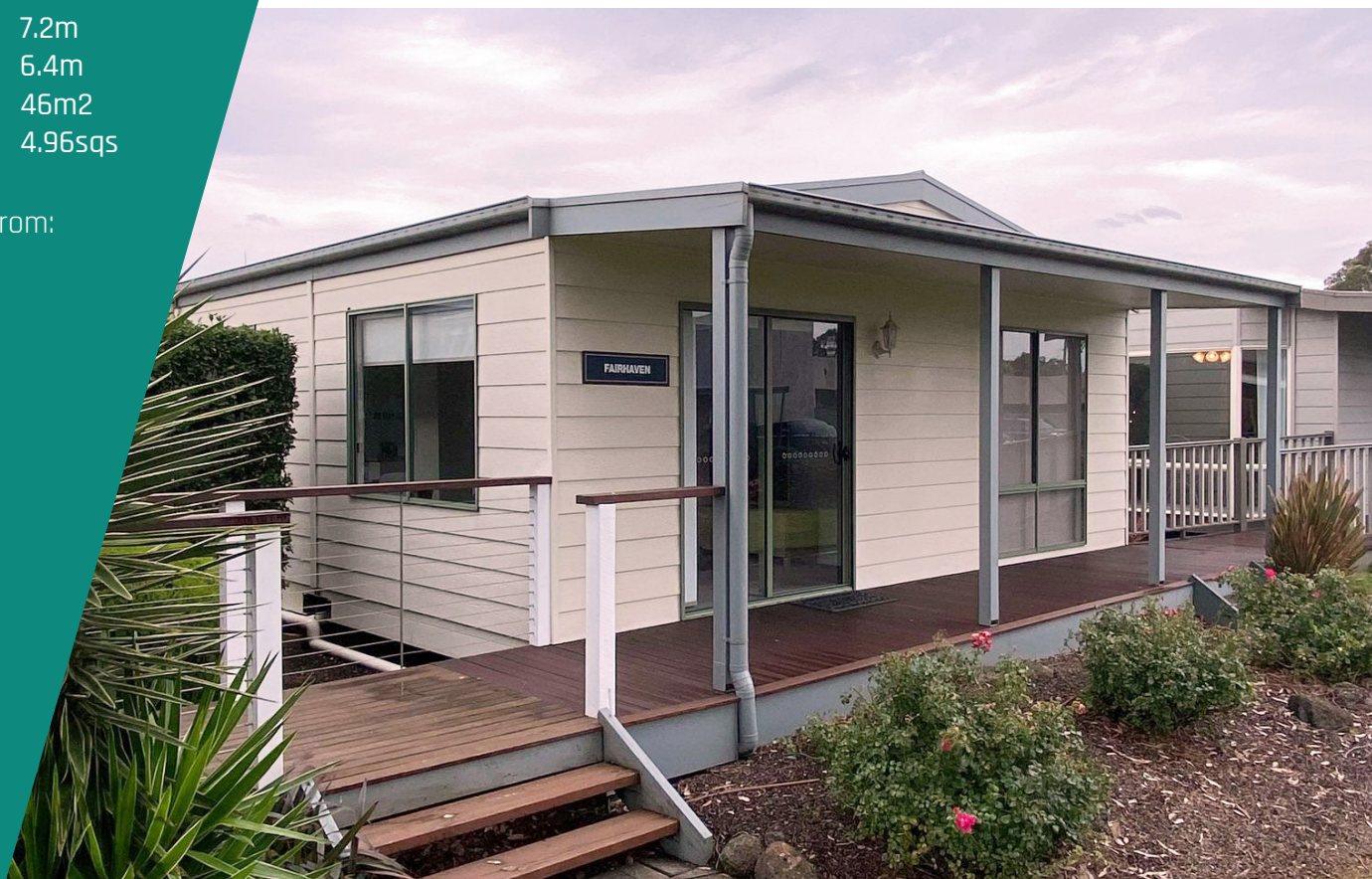
VILLAGE DISPLAY MODEL