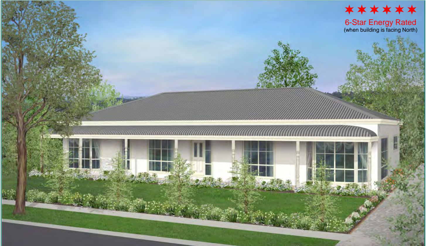
◆ English Colonial Façade pictured

★★★★★★ 6-Star Energy Rated (when building is facing North)