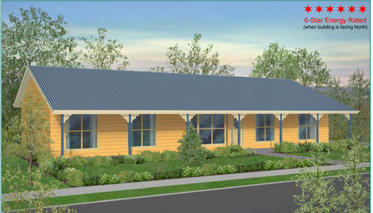
◆ Ranch Style Façade pictured

★ ★ ★ ★ ★ ★ 6-Star Energy Rated (when building is facing North)